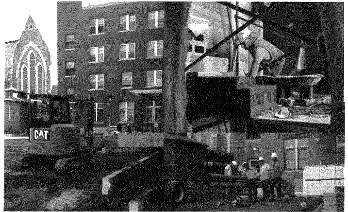
Close to 50 workers arrive at 52 High Street each day to help make this century old building a safe and reliable home for women.

On the second and third floors of the annex, the bedrooms and hallways have been painted and the woodwork around the windows and doorways have been restained. It is amazing to see what a fresh, clean coat of paint can do to truly transform a space! The attention to detail and care that the close to 50 men and women who are working on this project show daily